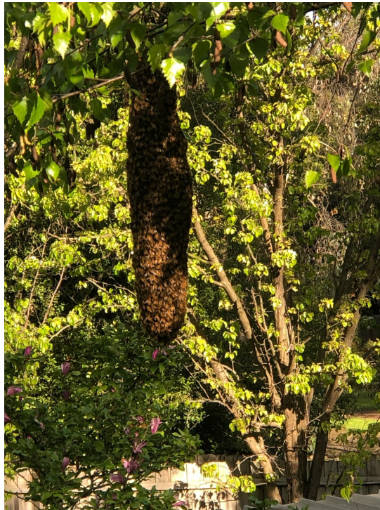
A swarm of bees

There were new members to the club, founding members of the club and "friends of" club members and this all led to a stimulating discussion about what is happening in everyone's bee hives - it is amazing how the honey supply is so varied in the Emerald region.