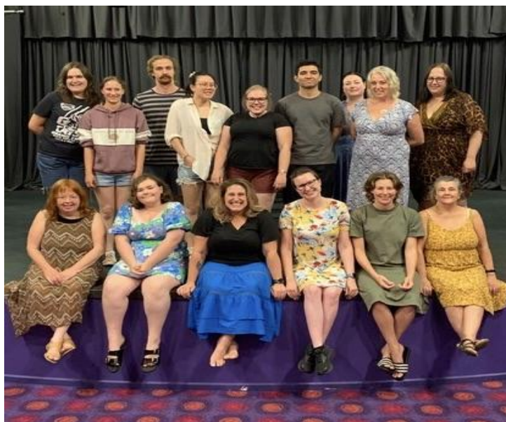
Some of the "Much Ado" cast

19 February – Gemco Players Community Theatre AGM – 2-4pm, The Foyer, The Gem Community Arts Centre. All are welcome.