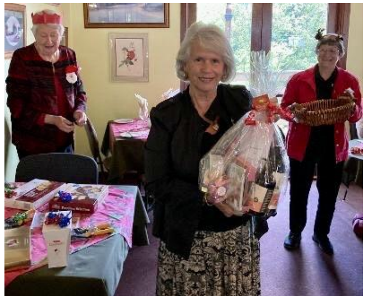
A Probus member was delighted with her lucky door prize at our Christmas lunch. Hamper kindly donated by Emerald Village Pharmacy.

Are you a lady who's recently retired and looking for some social activity? Why not join Emerald Ladies Probus Club? Emerald Ladies Probus Club opens the door to new experiences and friendships to all retired or semi-retired ladies. You can hear wonderful guest speakers at our monthly meetings, and you'll have the opportunity to participate in a wide range of activities and outings held throughout the year. During the next couple of months we're visiting Mont De Lancey Homestead in Wandin, seeing performances at Bunjil Theatre in Narre Warren, and we're off to the movies. We'd love you to join us.