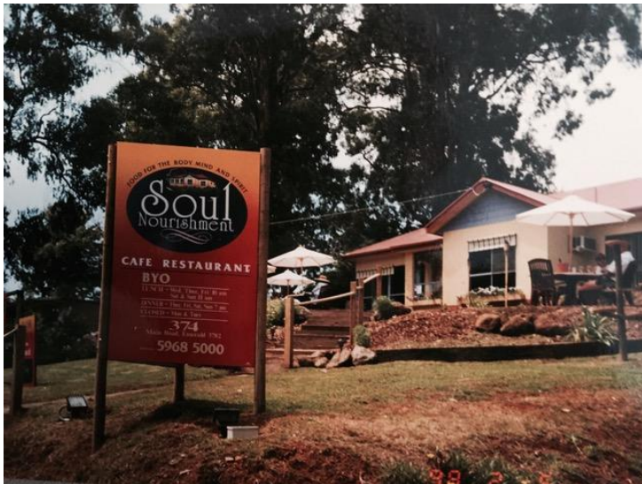
Hands up who shared a meal at Soul Nourishment - now Elevations.