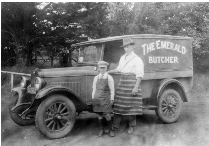
A few years before Al Mills and Pete Castricum ran our Butcher store!!!