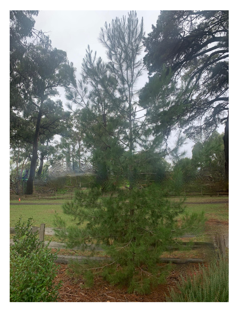
I have grown from a seed that has its origins over 100 years ago.

The first correct entry will receive a $15 voucher for The Laughing Fox.