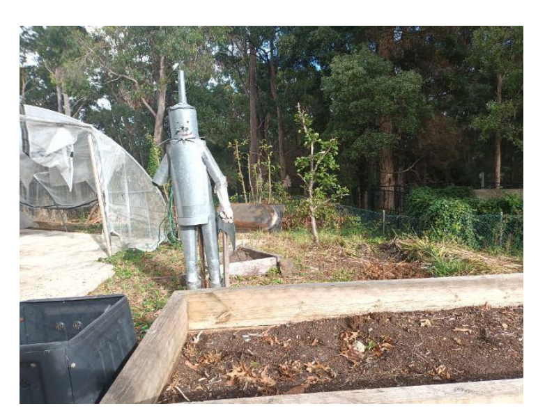
'A tin man scarecrow protects the Kitchen Garden at Emerald Secondary College'.

The funds will be used to establish a sustainable garden area that can be used for the whole school community. The fruit and vegetables yielded will supply food technology classes with fresh produce, propagation of new plants and seedlings will be used within the school grounds, science students will explore the flora and fauna, and VCAL students will have an opportunity to develop their enterprise skills and generate income to support their community projects. Students will also raise chickens, giving them knowledge and skills to care for living creatures.