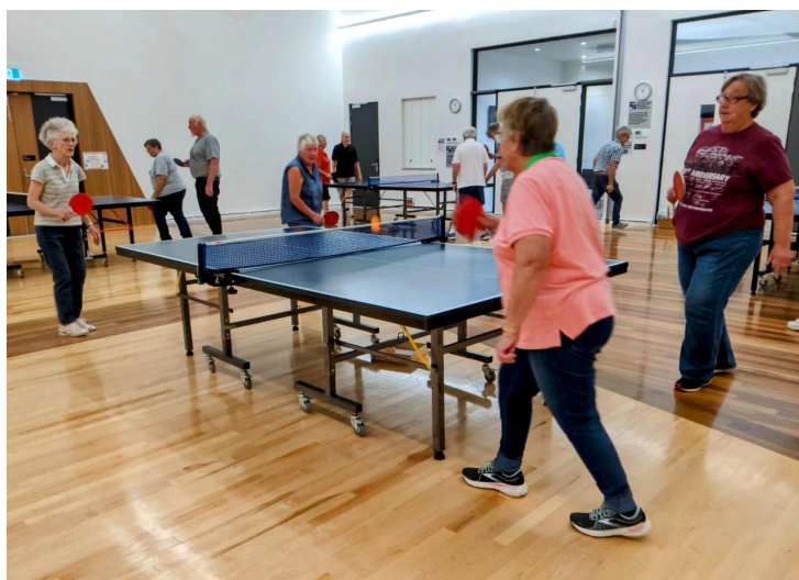
U3A table tennis in progress