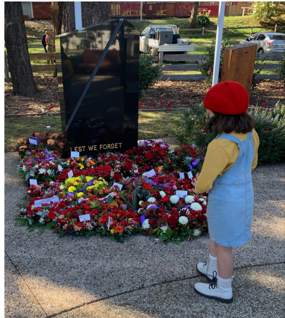
A lone young visitor to Anzac Place after Emerald had laid wreaths and poppies. Lest We Forget.