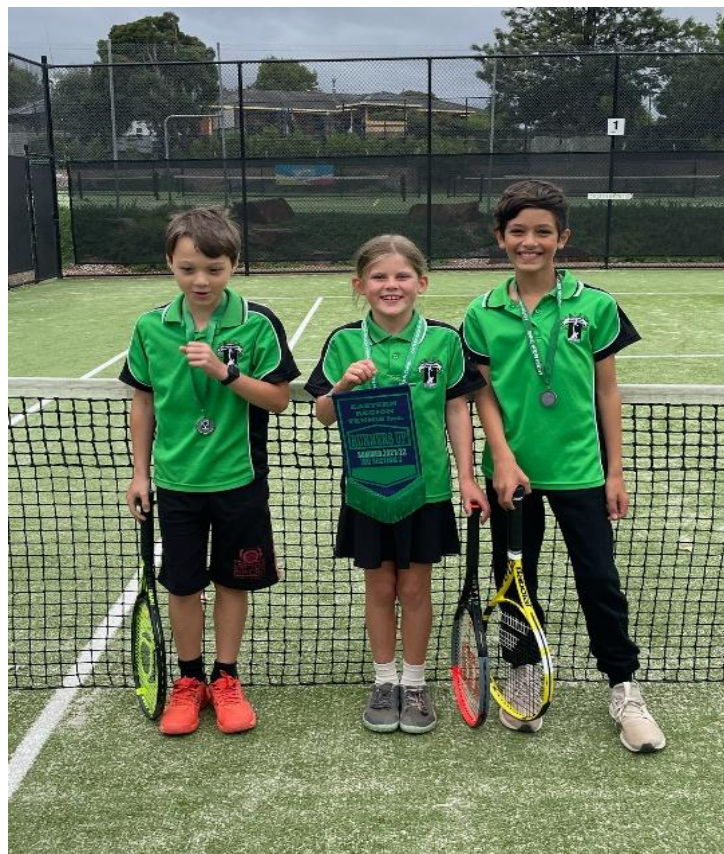
Three keen junior members of the Emerald Tennis Club.