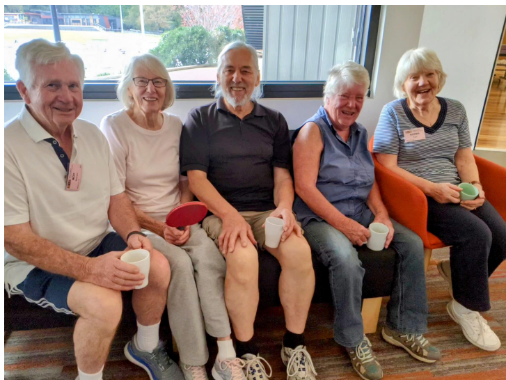
Taking a rest - U3A members