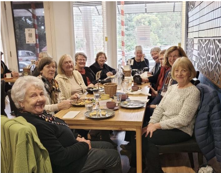
Probos members enjoying their monthly 'Nosh & Natter' lunch at the Laughing Fox Cafe in Emerald.

There's lots happening at Emerald Ladies Probos to keep you occupied over these winter months. Aside from our usual monthly meeting and guest speaker we also have a movie outing, our 'Nosh & Natter' lunch and a Bunjil Daytime Theatre show on our calendar. Our club is non-fundraising and purely a social outlet to have fun with like-minded people.